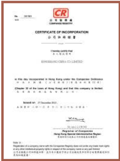
Certificate of Incorporation